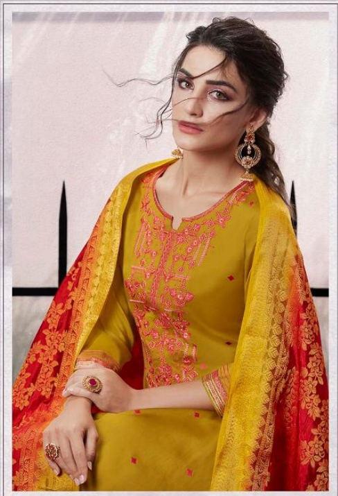
MODERN STYLE THE PERFECT BLEND OF ETHNICITY AND MODERN STYLE TO BLEND YOU SPECTACULAR LOOK! *** D>NO>5117