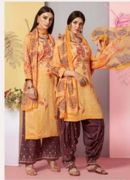
5 1 0 8