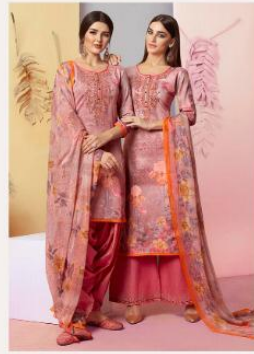
5 1 0 6