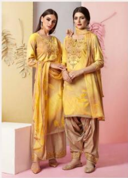
5 1 0 3