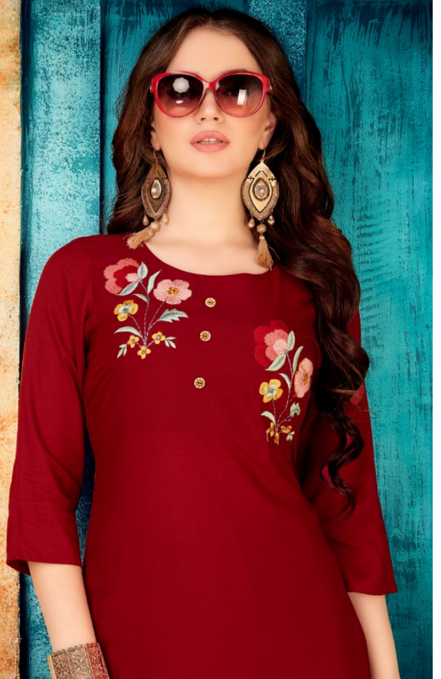
INDIGO GO CHIC INDIGO IS THE WAY TO GO THIS SUMMER