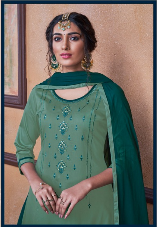
Flaunt the pretty colors and exquisite designs coupled with quality and freshness.