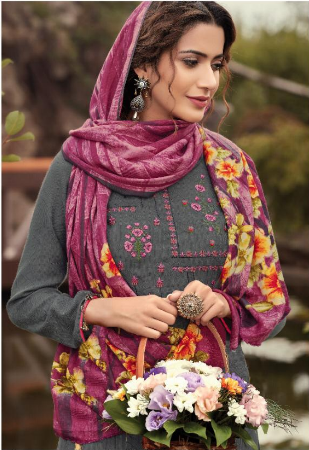
Now the style for women with true colors dress with eye-catching theme & dazzling designs.