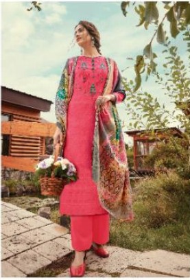
CODE # 1001