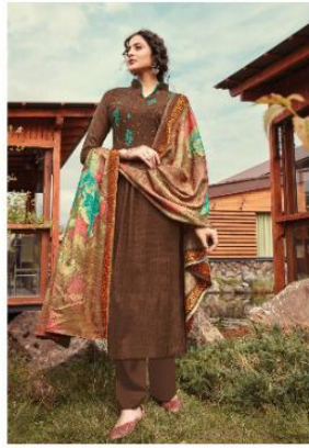
CODE # 1002