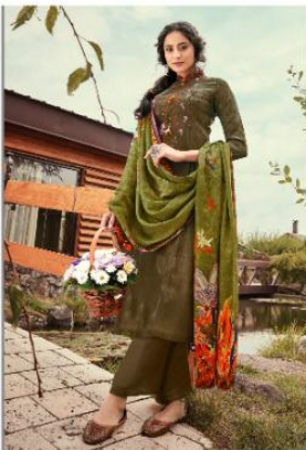
CODE # 1005