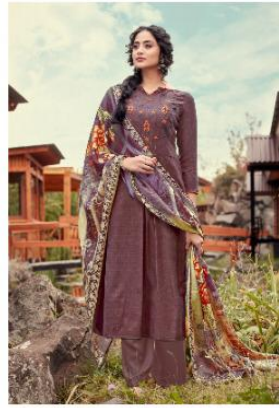
CODE # 1003