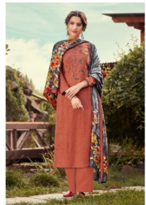
CODE # 1008