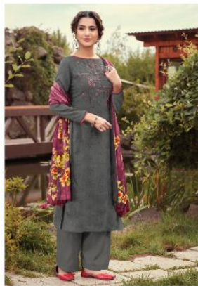
CODE # 1006