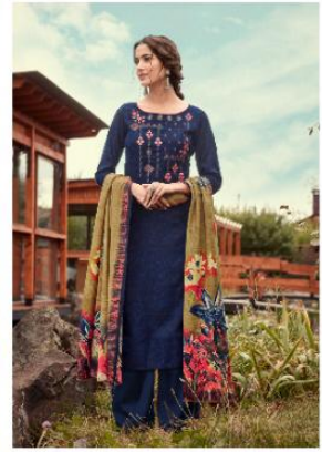
CODE # 1004