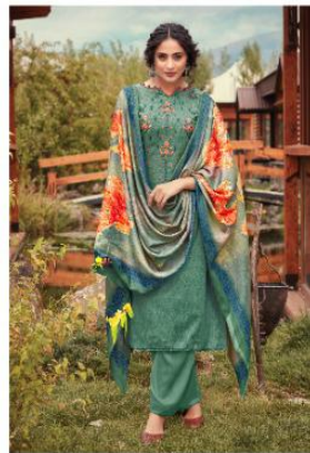
CODE # 1007