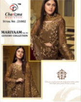
STYAL No. 21002 MARIYAAM Vol-02 LUXURY COLLECTION