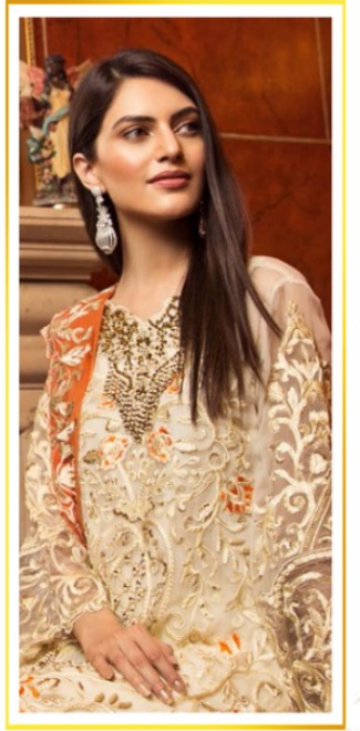
STYAL NO . 21005 MARIYAAM Vol-02 LUXURY COLLETION