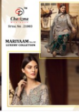
STYAL No. 21003 MARIYAAM Vol-02 LUXURY COLLECTION