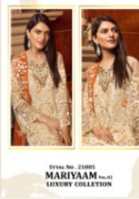
STYAL No. 21005 MARIYAAM Vol-02 LUXURY COLLECTION