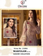
STYAL No. 21004 MARIYAAM Vol-02 LUXURY COLLECTION