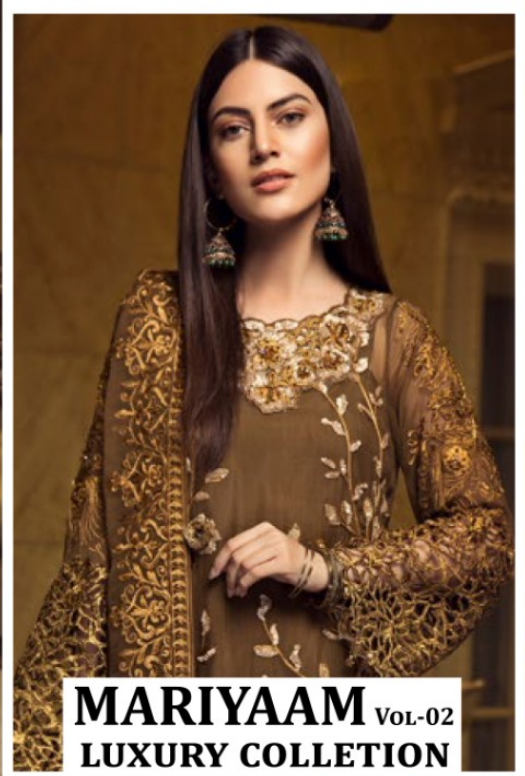
MARIYAAM Vol-02 LUXURY COLLETION