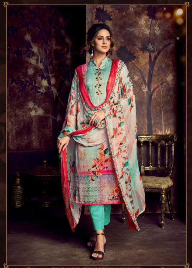
Shavata Your look with ultra pretty Aarti floral print in soft colours that will make you feel as light as a breeze. — 316-009 —