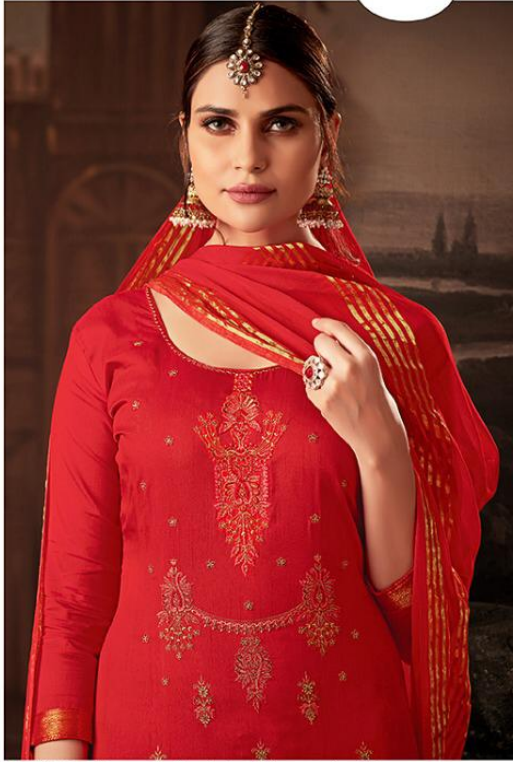
We are like ordinary. They every woman have their own beauty and Belliza gives extra ordinary look to you...