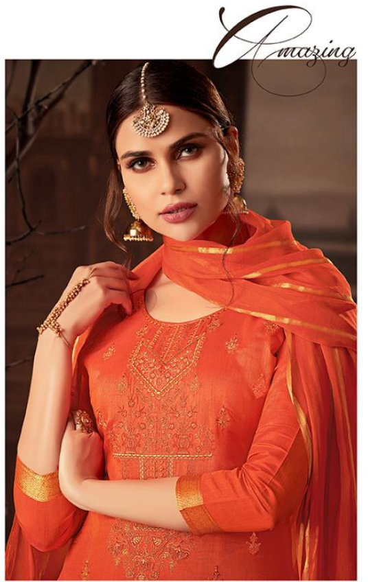
Embroidered orange with alluring floral patterns in bright orange and gold glances to your life. Wear your red hair and make it naturally get and all the way party.