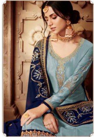
ELEGANT EMBROIDERED CONTRAST ◆◆ ENSEMBLE ◆◆