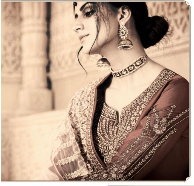
CONTRAST ROMANTIC GEORGETTE WITH GAMINE TAILORING