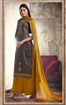
D No 10078