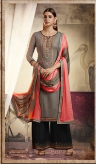
D No 10073