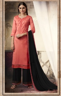
D No 10076