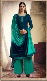
D No 10071