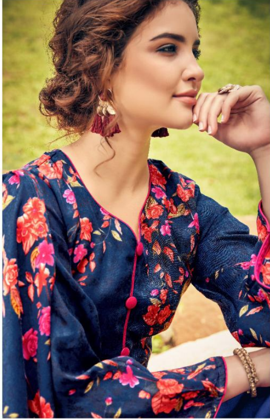
If a woman's dress should be a veil, a veil should not obscure her face, sewing is purpose without obstructing the view