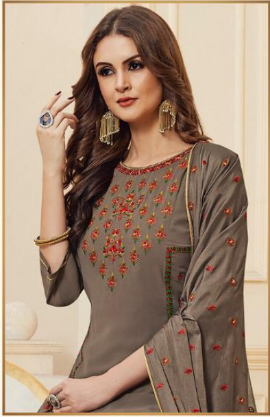
Get dazzled with vivacious colors of India and bring out the ethnic side of you with this beautifully crafted piece.