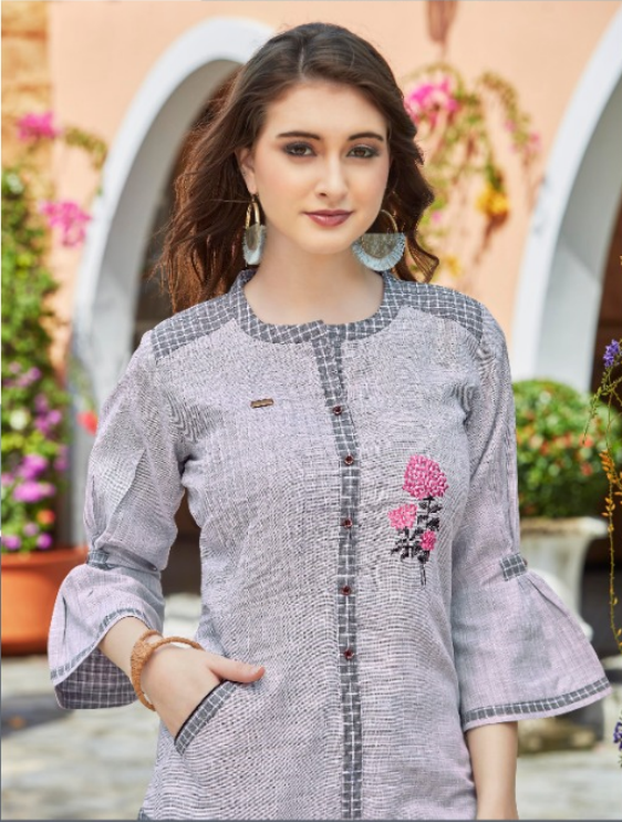
with it's vibrant prints , bold colors the new season on the indian runway is the perfect mix of modern and ethnic. all you have to do choose your favourite