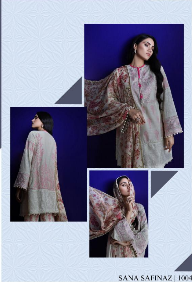
SANA SAFINAZ | 1004