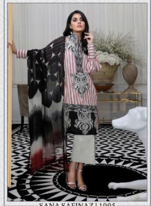
SANA SAFINAZ | 1005