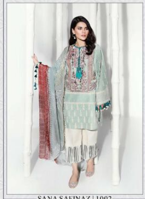
SANA SAFINAZ | 1002