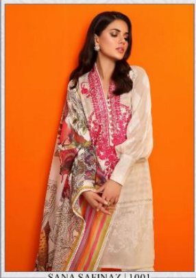
SANA SAFINAZ | 1001