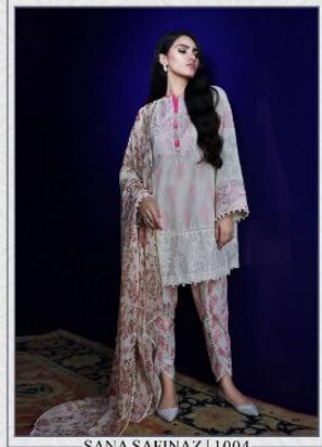
SANA SAFINAZ | 1004