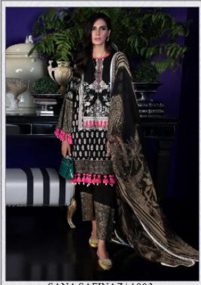
SANA SAFINAZ | 1003