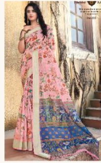
AR - 10