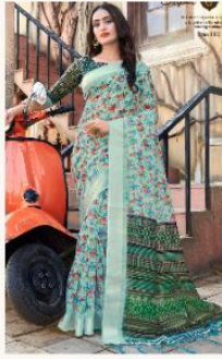
AR - 03