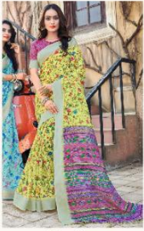
AR - 01