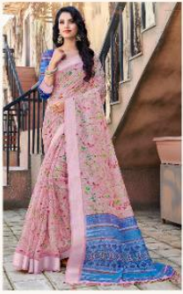
AR - 04