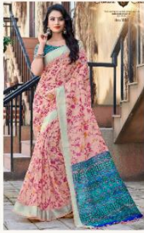
AR - 06