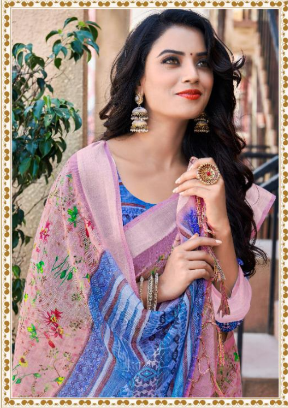
This rich saree is paired along with a beautiful blue blouse the large motifs on the saree are chic AR - 64