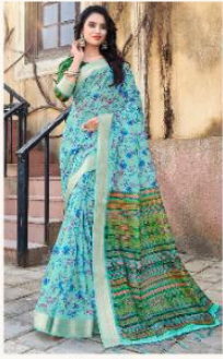
AR - 02