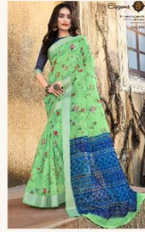
AR - 08