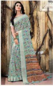
AR - 05