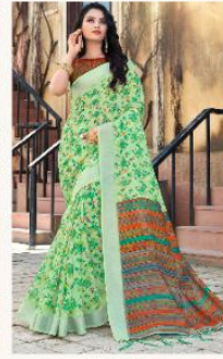
AR - 09