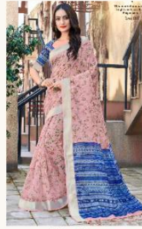
AR - 07