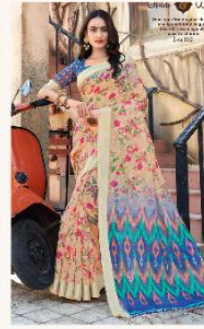
AR - 12