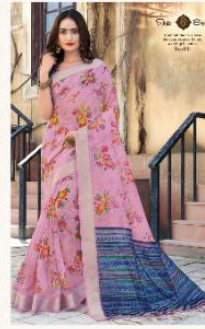
AR - 11