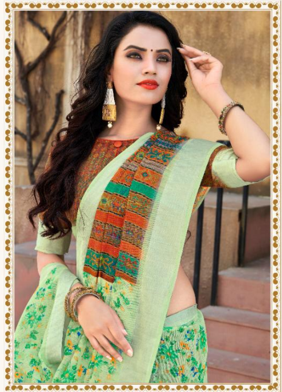
When are saree in worn - out material it s most easily recognized as are.