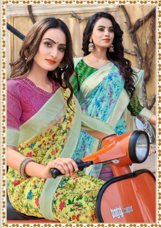
This beautiful green saree is basic and elegant, the big motifs in gold threading make it even more stunning