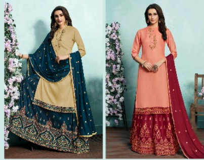
D. No.: 2003