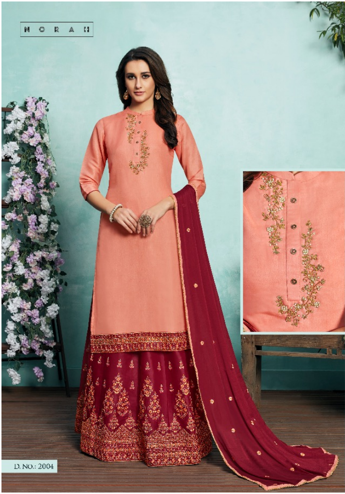
D. No.: 2004