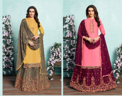
D. No.: 2001