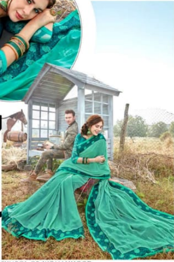
SYMBOL OF WOMANHOOD LEGENDARY WOMANHOOD IS THE ONLY ACHIEVEMENT OF WOMEN IN THE HISTORY OF HUMANITY.