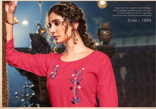
India, there are a couple of hundred Indian fashion designers producing designs and many of them are well known and are expanding slowly but surely into the international market. D.no - 1004