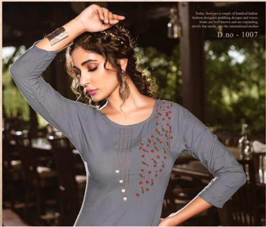
India, there are a couple of hundred Indian fashion designers producing designs and many of them are well known and are expanding slowly but surely in the international market. D.no - 1007