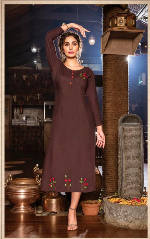
D.no - 1008