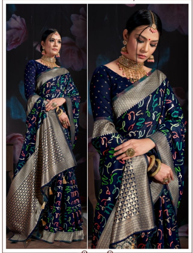
Bright red with blue combination - a very vibrant energy holding different shades. contemporary yoke design with chawar border technique, a perfect design for any occasion any time...