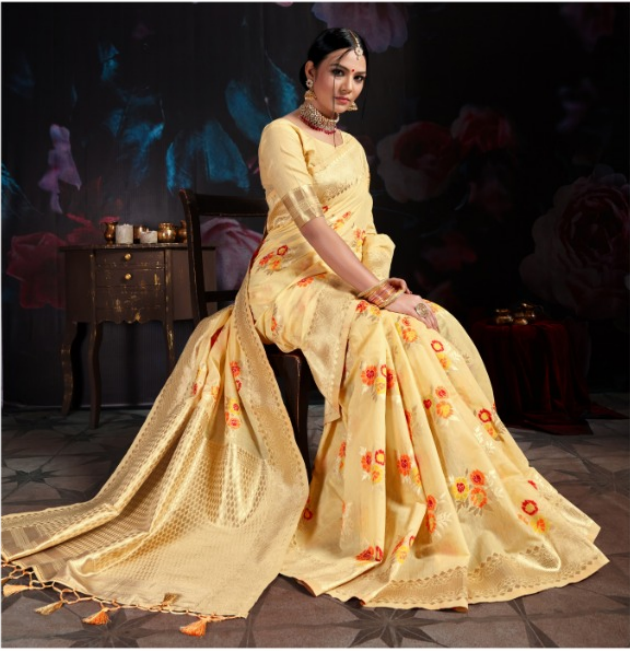
Be a center of attraction in any occasion in this beautifully printed designer saree.