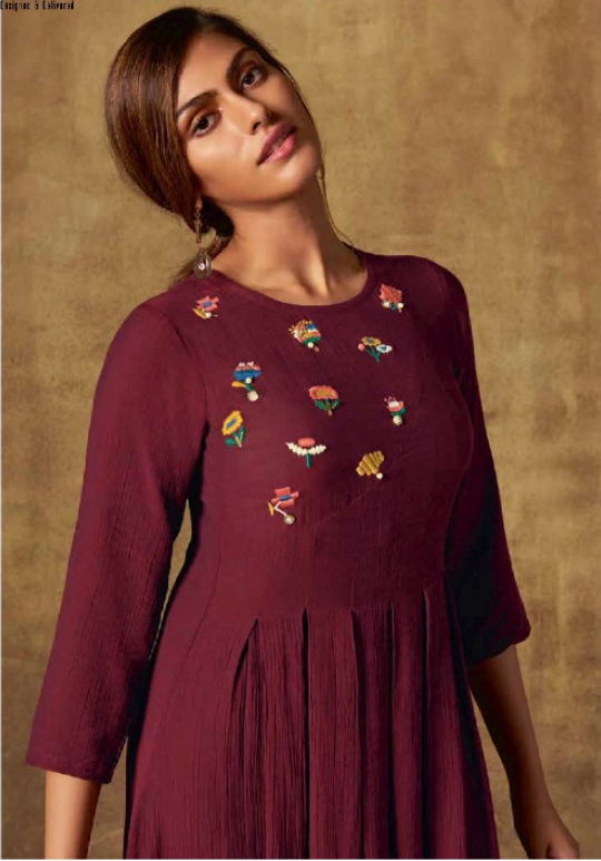
This second bejarra with two-button shape that is low. The case all women with panels of cotton and crepe paper. Hand-Making. The fabric is soft, sensitive and designed especially for wear this season with "MILKWAY".