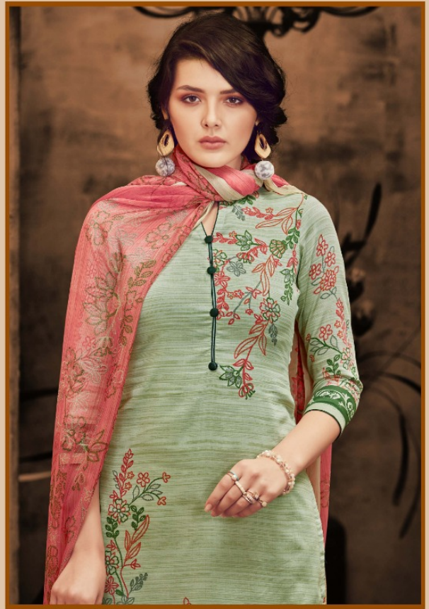
THE COMBINATION OF RED PRINTED DRESS AND DUPATTA ELEVATES YOUR STYLE THIS SEASON.