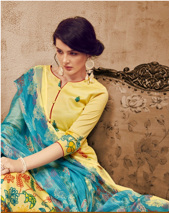
BRINGS A WHOLE NEW RANGE OF VARIETY FOR THE MOST INSPIRING AND COLORFUL ONES IN THE WORLD. THERE'S PLENTY OF PRETTY GORGEOUS FLORAL PRINTS IN EXOTIC COLOR COMBINATIONS. 152-003