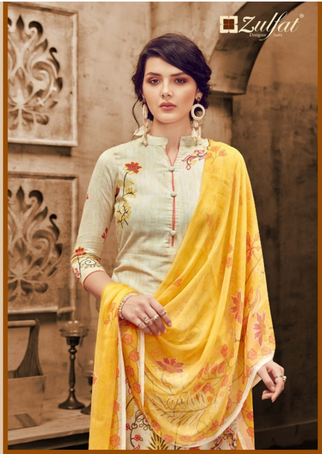
AN INSPIRATIONAL FABRICS UNDER THE DESIGNER, PRINTED, IS TRUE TO ITS NAME. TRADITIONAL AND FOR WOMAN FROM ALL WALKS OF LIFE.