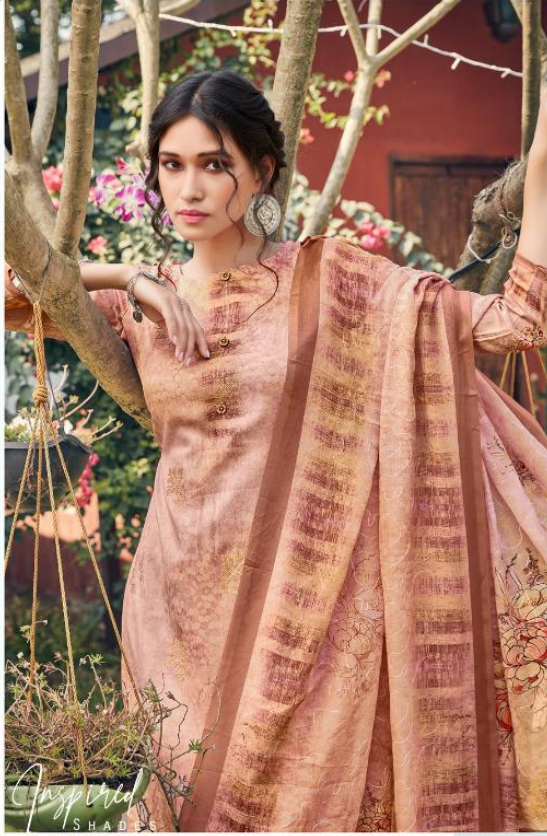
Inspired SHADES this season assortment brings your word rise too close to great looking colours and fantastic patterns...