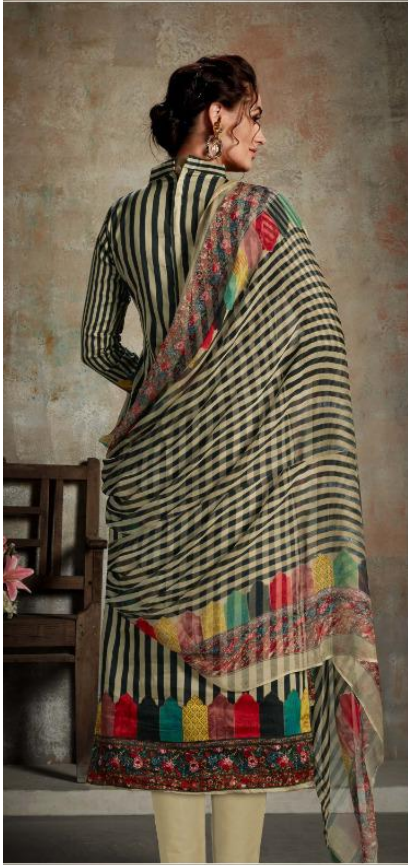
BEAUTIFUL CIRCULAR PRINTED DRESS DUPATA INSPIRED BY THE BEAUTY OF NATURE