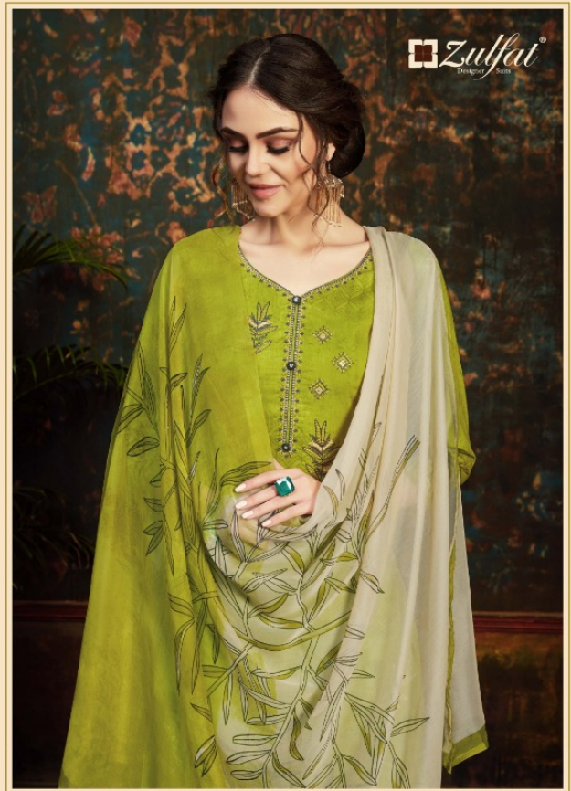
161-048 THE CHARM OF INDIAN RAJASTHAN FROM TRADITIONAL ARTS TO CONTEMPORARY STYLISHNESS OF THE 21ST CENTURY. BEGETTING CLOTHES.