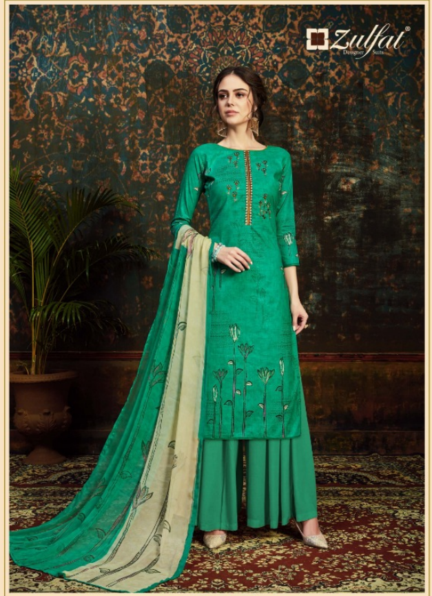
161-006 THE CHARM OF CULTURE OF INDIAN RAJASTHAN FROM TRADITIONAL MOTIF TO CONTEMPORARY DESIGN OF FOLK AND VIBRANT REGIONAL COLOURS.