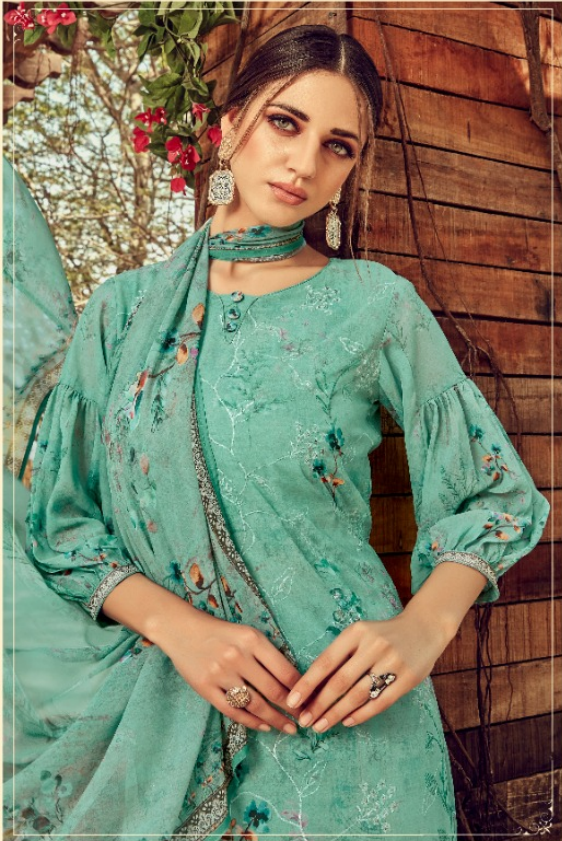
Fashion is a language some know it, some learn it, some never will like an instinct.