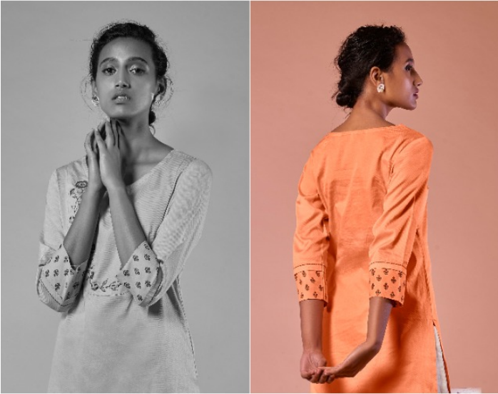
Every individual is an expression of the whole (color of nature), a unique section of the whole (nature is). This collection is all about colored cotton tunics to add a pop to your wardrobe.