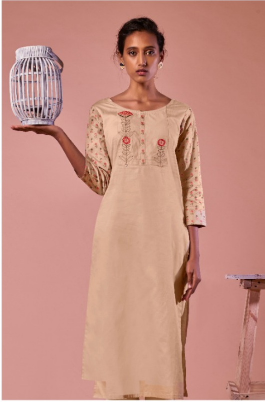
every individual is an extension of the white thread of nature, a unique story of the whole universe. This collection is all about celebrating nature, ready to add a pop to your wardrobe.