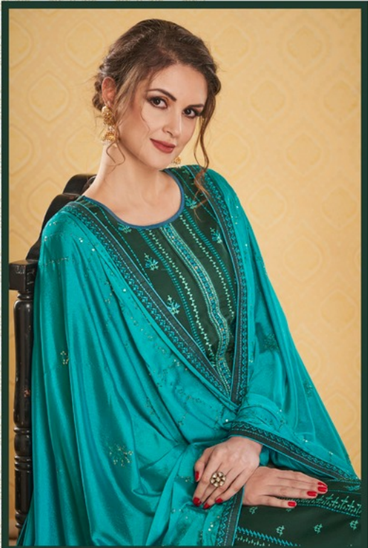
CAST A REGAL SPELL OF TRADITION. D.NO.10177