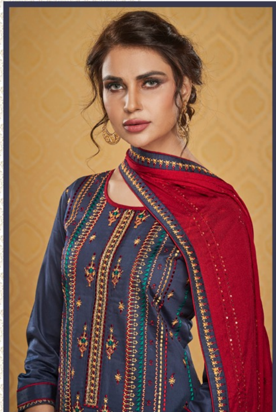
CAST A REGAL SPELL OF TRADITION. D.NO.10176