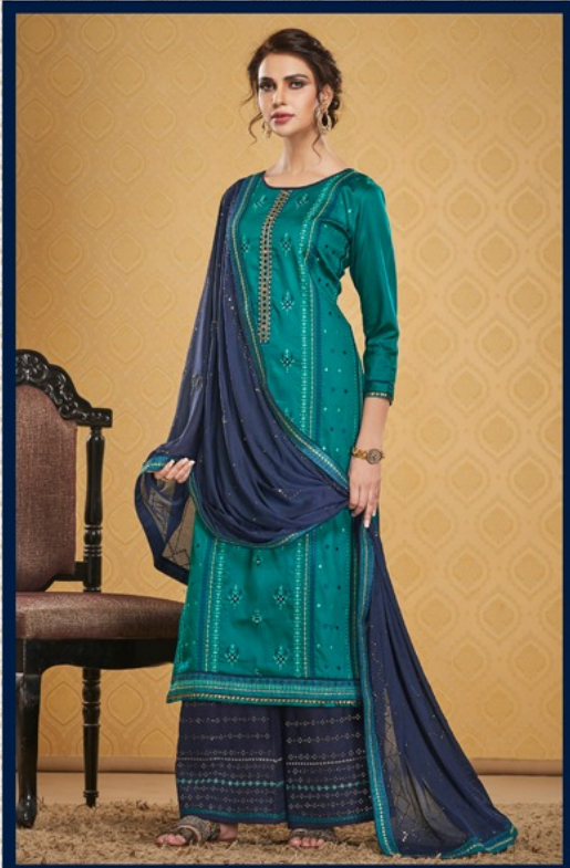
CAST A REGAL SPELL OF TRADITION. D.NO.10173