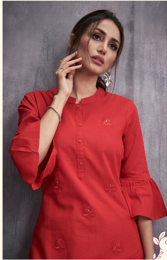
KURTI: COTTON SLUB WITH COMPUTER EMBROIDERY PALAZZO PANTS: COTTON LINA WITH ETHNIC BLOCK STATE PRINT