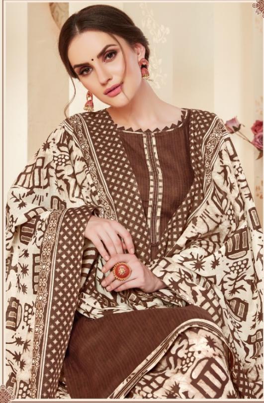
classic to temporary- the contemporary designs with classy colors giving luxurious touch with finish heavy look.