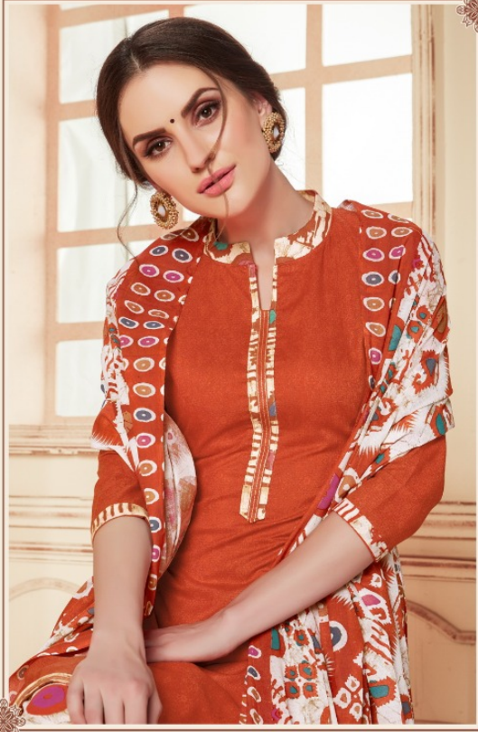
classic to temporary- the contemporary designs with classy colors giving luxurious touch with finish heavy look.