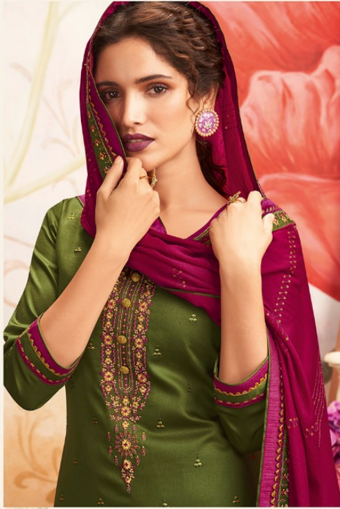
TRADITIONAL GLAMOUR 113