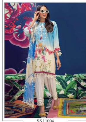
SS | 1004