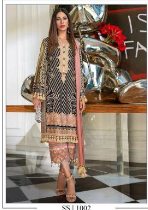
SS | 1002