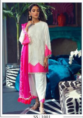
SS | 1001