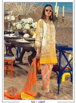
SS | 1005