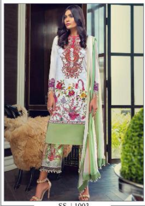
SS | 1003