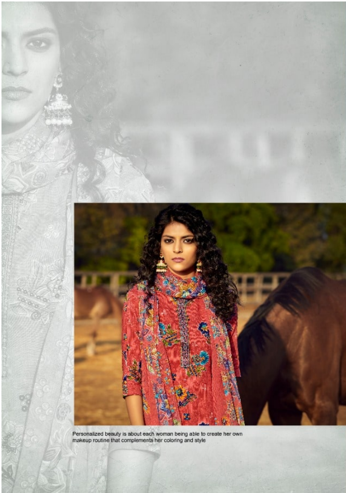
Personalized beauty is about each woman being able to create her own makeup routine that complements her coloring and style