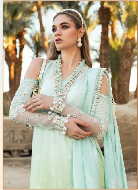
MARIYA.B.LAWN SPRING SUMMER-20 Vol-2