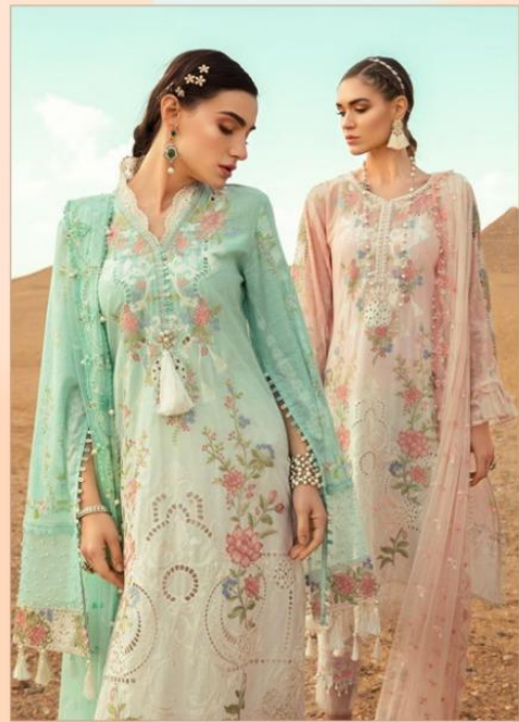
MARIYA.B.LAWN SPRING SUMMER-20 Vol-2