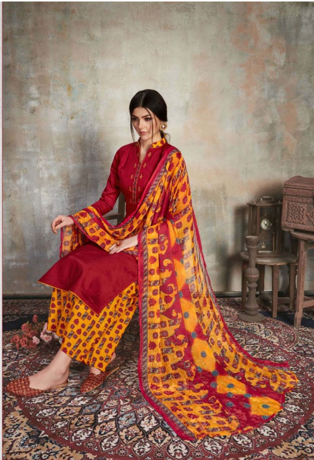
you must dare to be different coz styling is always to be exclusive. differentiate yourself by jazzing up with our designs. 428 - 003