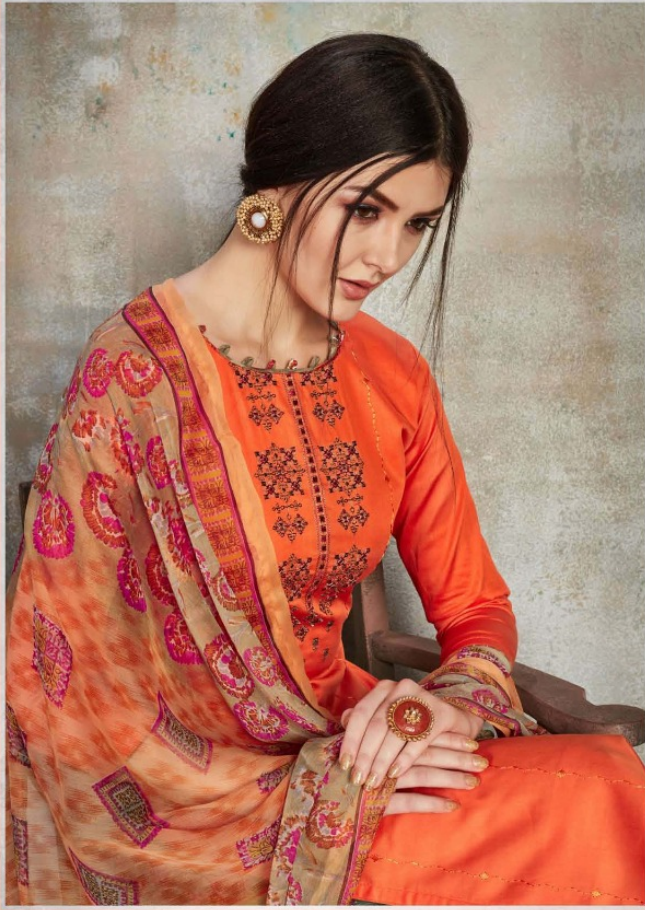
you must dare to be different coz styling is always to be exclusive. differentiate yourself by jazzing up with our designs.