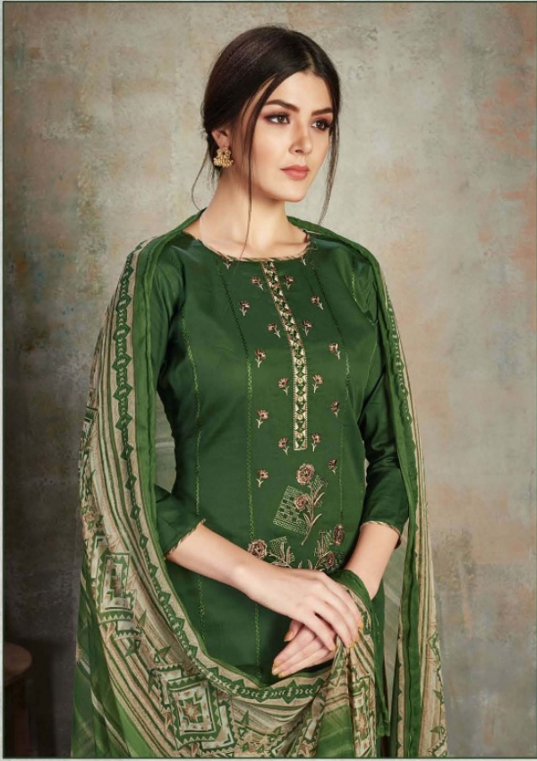
you must dare to be different coz styling is always to be exclusive. differentiate yourself by jazzing up with our designs. 428 - 002