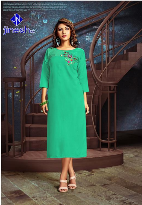
D.NO. - 1006