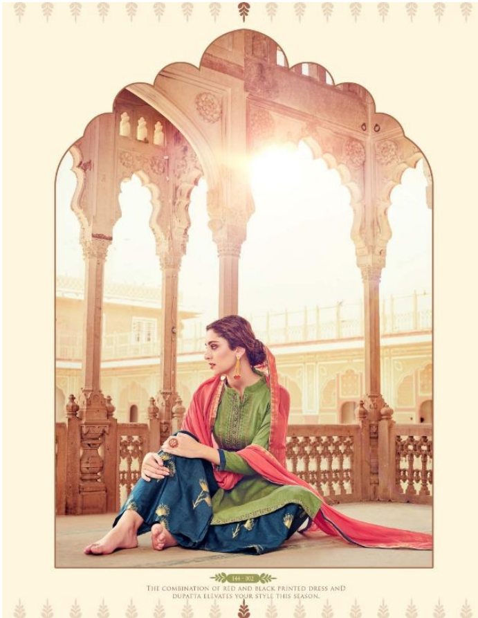
THE COMBINATION OF RED AND BLACK-PRINTED DRESS AND DUMPTA ELEVATES YOUR STYLE THIS SEASON.