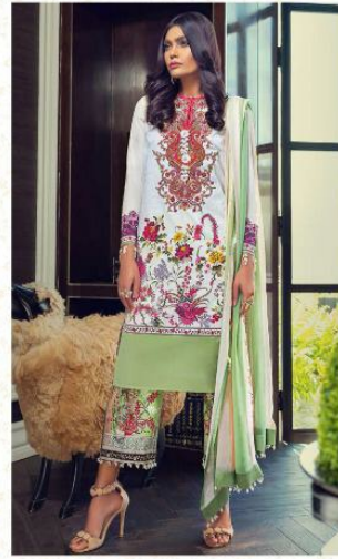
D.N 1003 NX