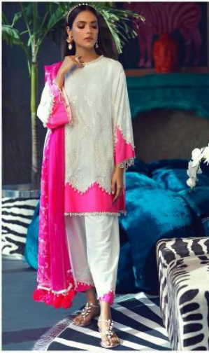
D.N 1001 NX