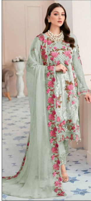
S - 119 C