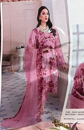
TOP - FOX GEOR BOTTOM - INNE DUPATTA - NAJINI