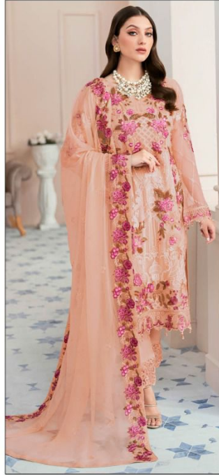
S - 119 B