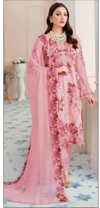
S - 119 D