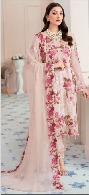
S - 119 A