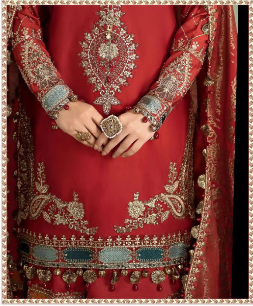
MARIYA B EMBROIDERED FESTIVAL COLLECTION VOL-1