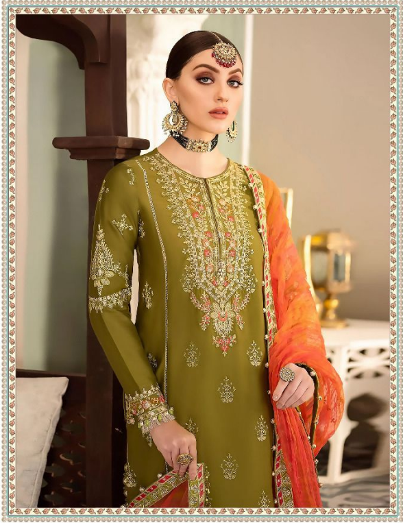
MARIYA B EMBROIDERED FESTIVAL COLLECTION VOL-1