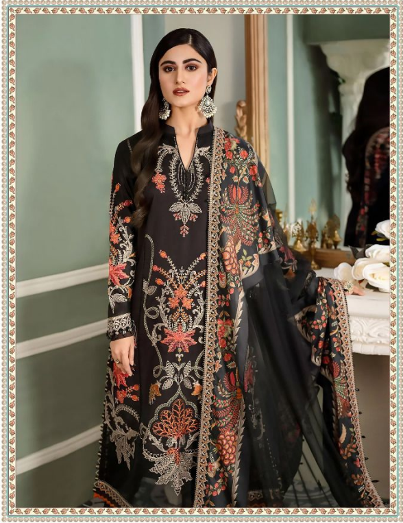
MARIYA B EMBROIDERED FESTIVAL COLLECTION VOL-1