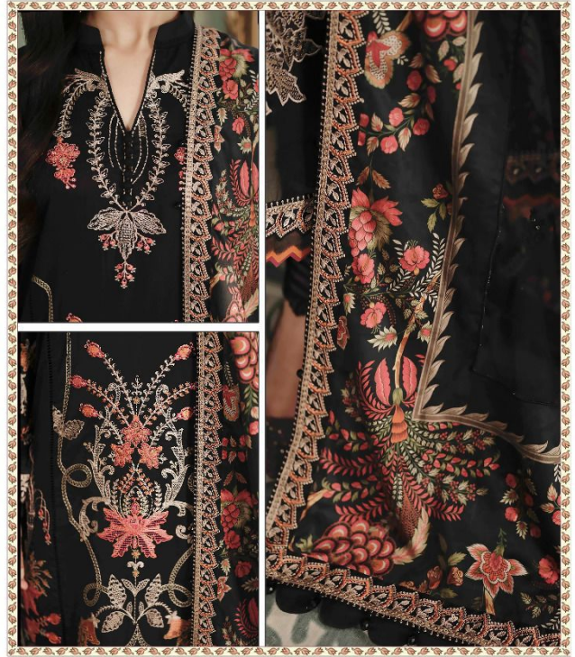
MARIYA B EMBROIDERED FESTIVAL COLLECTION VOL-1