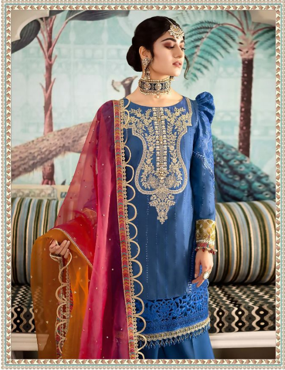
MARIYA B EMBROIDERED FESTIVAL COLLECTION VOL-1