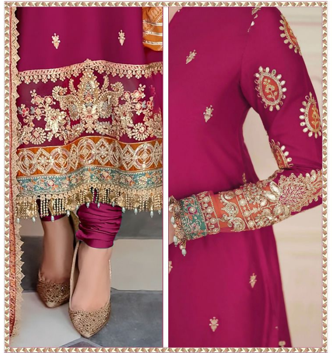
MARIYA B EMBROIDERED FESTIVAL COLLECTION VOL-1