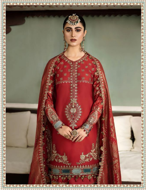
MARIYA B EMBROIDERED FESTIVAL COLLECTION VOL-1