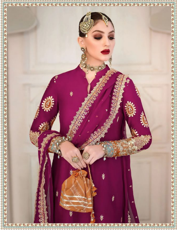
MARIYA B EMBROIDERED FESTIVAL COLLECTION VOL-1