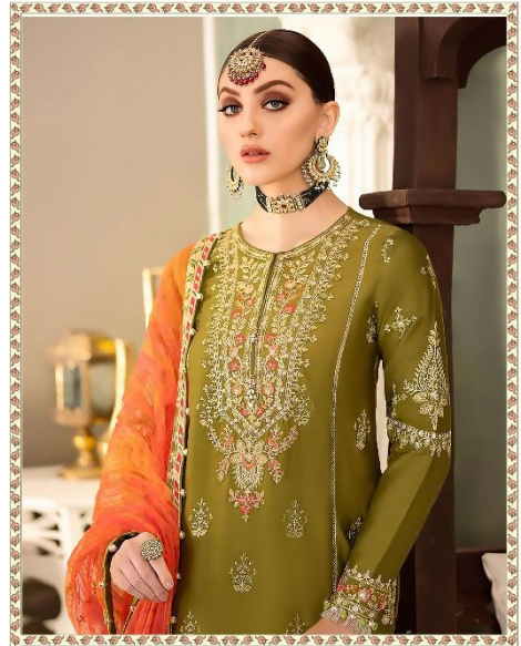
MARIYA B EMBROIDERED FESTIVAL COLLECTION VOL-1