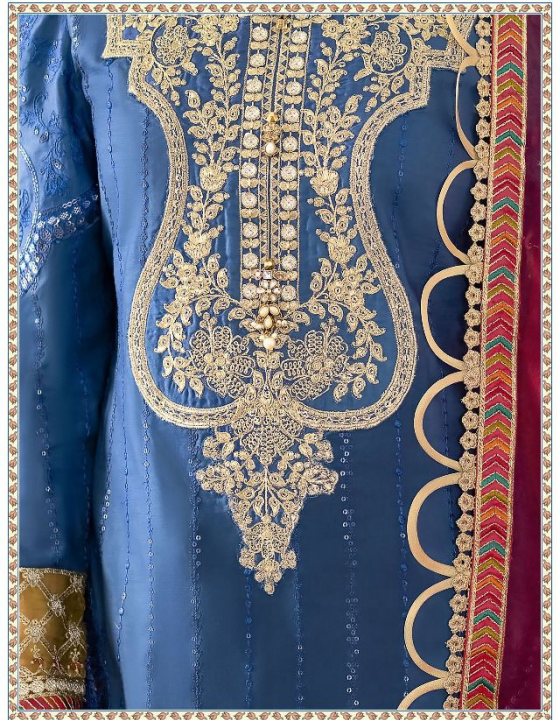
MARIYA B EMBROIDERED FESTIVAL COLLECTION VOL-1