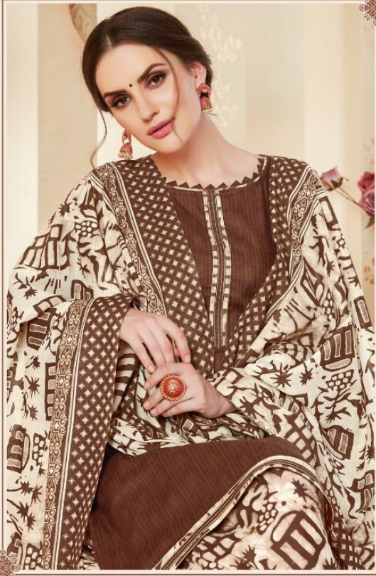
classic to temporary- the contemporary designs with classy colors giving luxurious touch with finish heavy look.