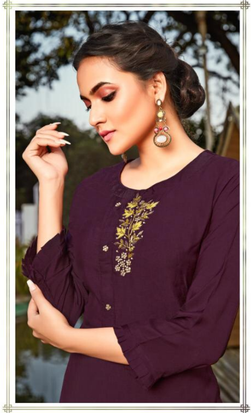
What you do, the way you think, makes you beautiful