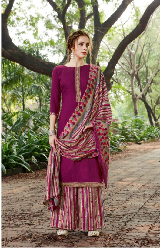
THERE IS BEAUTY IN ALL THINGS. YOU JUST NEED TO LOOK CLOSE ENOUGH!