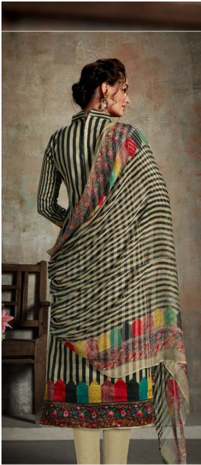
BEAUTIFUL CLASSIC PRINTED DRESS DRUWITA INSPIRED BY THE BEAUTY OF NATURE.