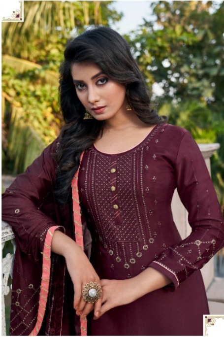
TRADITIONAL GLAMOUR ..124..