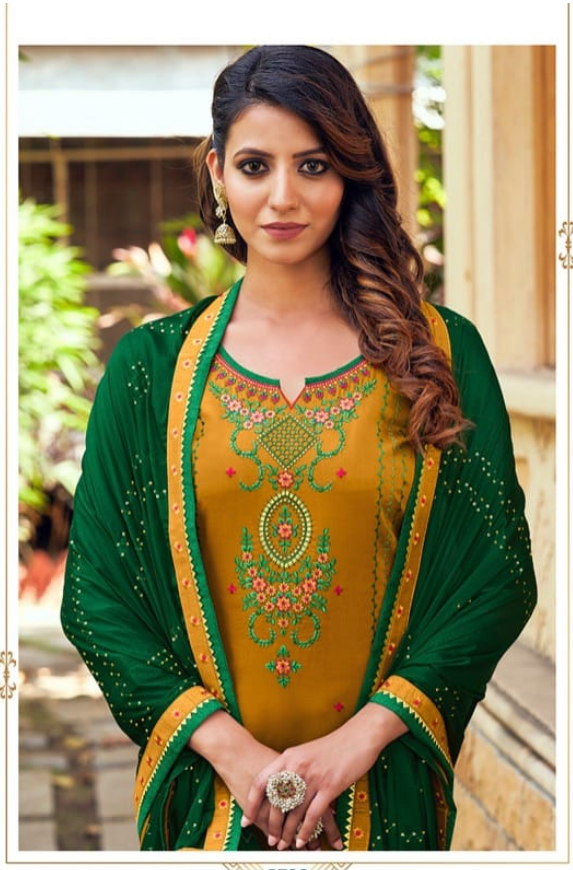
5722 A BLEND OF COLORS THAT HIGHLIGHT EVERY CORNER OF THE ATTRACTIVE DESIGNS THAT IN TURN ADORN YOU WITH VAST BEAUTY