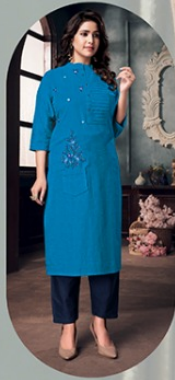
DESIGN NO : - 2826