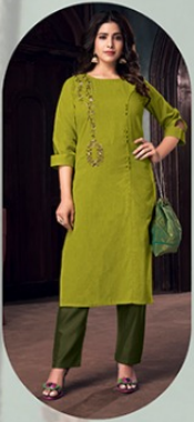
DESIGN NO : - 2824