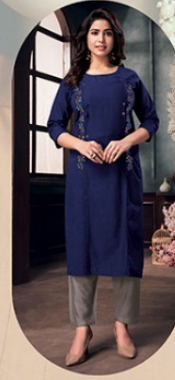
DESIGN NO : - 2828