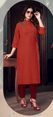
DESIGN NO : - 2827