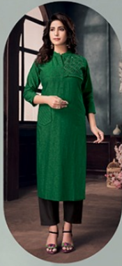
DESIGN NO : - 2822