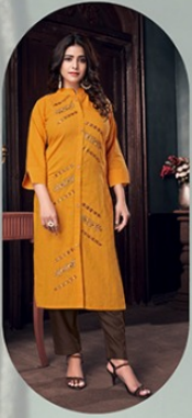
DESIGN NO : - 2821