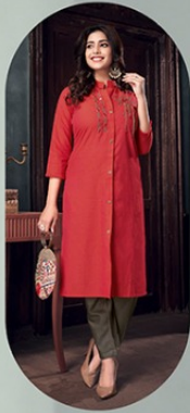
DESIGN NO : - 2825