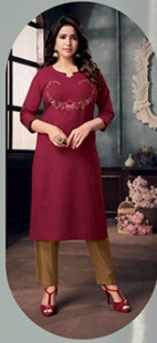
DESIGN NO : - 2823