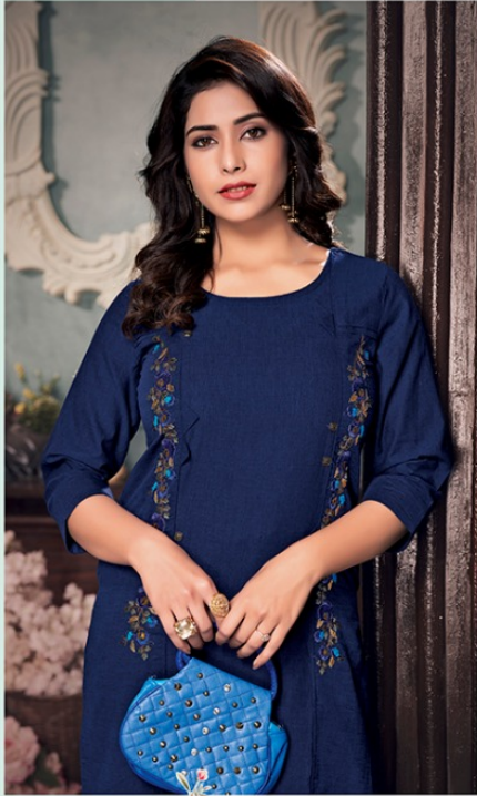
"MAYBE CAN BE DRESSED UP AND ELEGANT, BUT IT IS HOW PEOPLE DRESS IN THEIR DANCE OFF THAT ARE THE MOST INTERESTING."