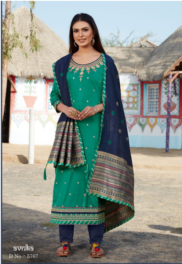
बचकौक D No :- 5767