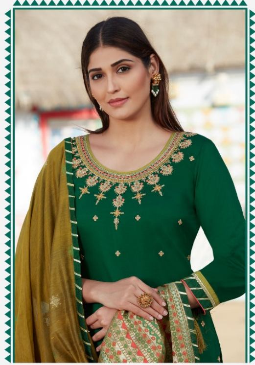
बनुझोरा D No :- 5764