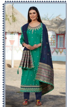
D No :- 5767