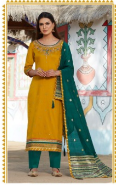
D No :- 5762