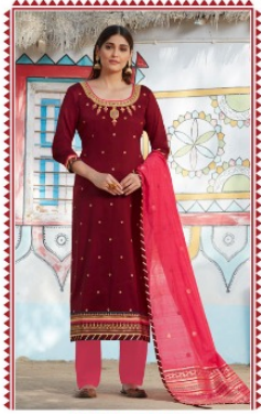
D No :- 5761