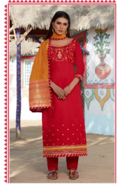
D No :- 5763