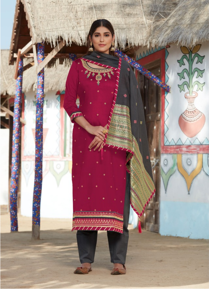
बोलेगंडवगौरव D No :- 5768