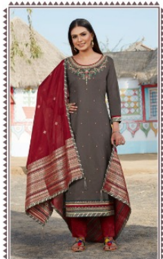
D No :- 5766