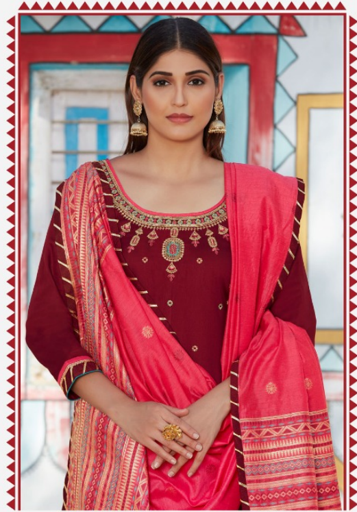
સાંકરનો D No :- 5761