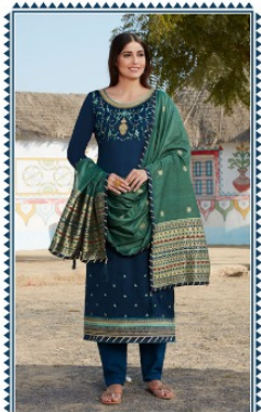
D No :- 5765