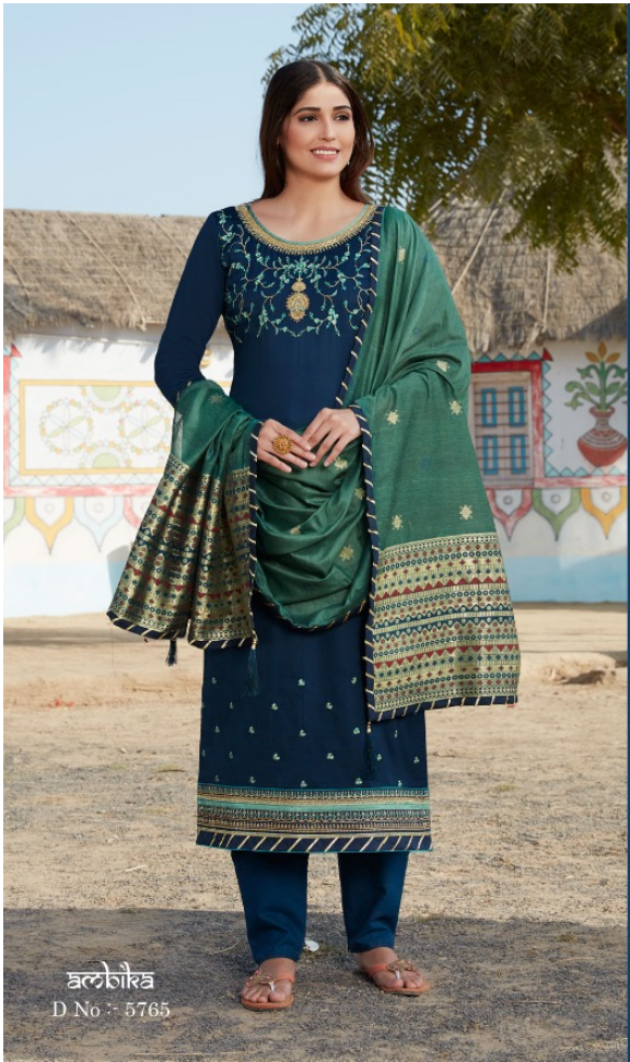
बल्लोरीक D No :- 5765