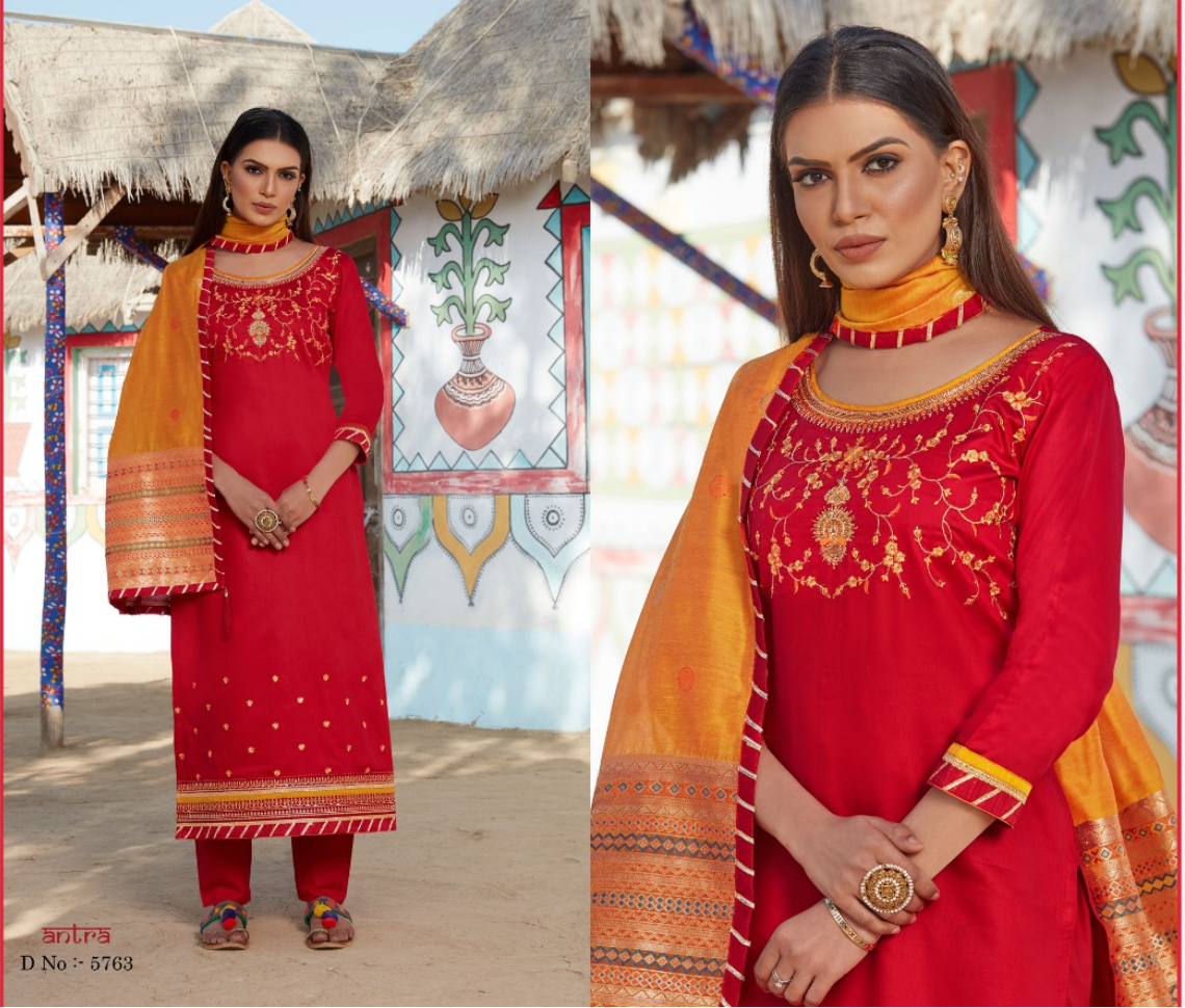
antra D.No :- 5763