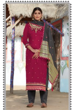
D No :- 5768