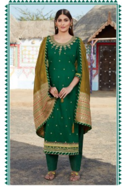
D No :- 5764