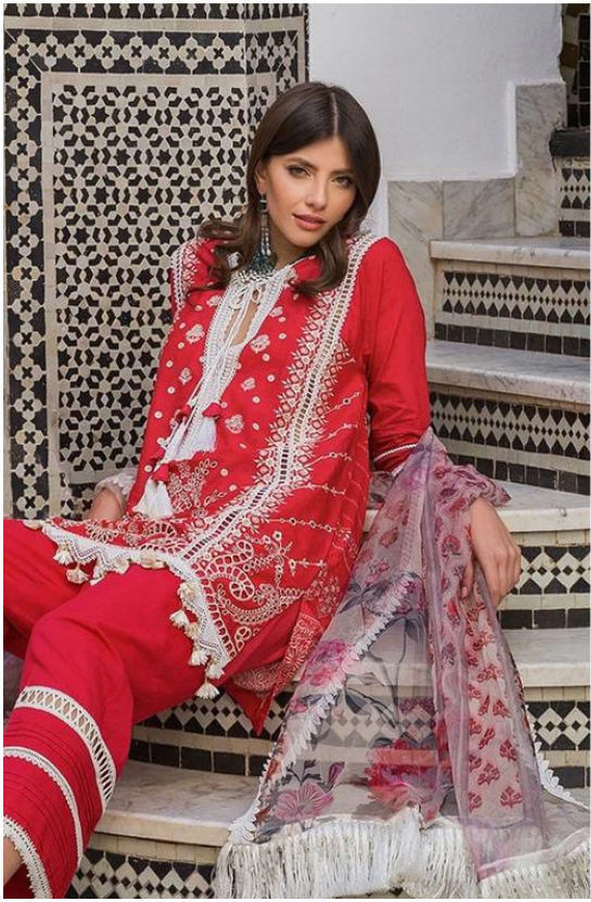
from the masterpieces, creativity and perfection bring new charm in you