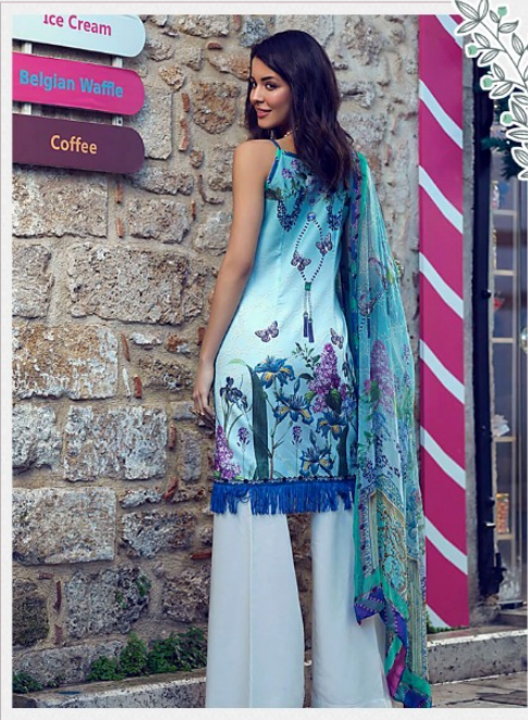
71001 SARANG VOL-2