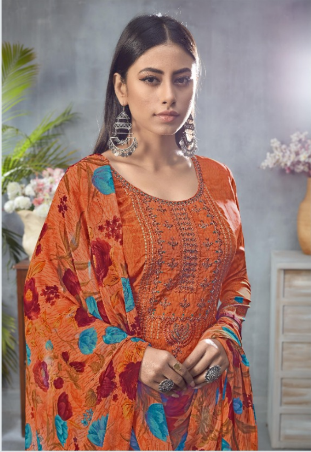
Enriched with remarkable designs, each piece from this line-up is an ethereal delight.